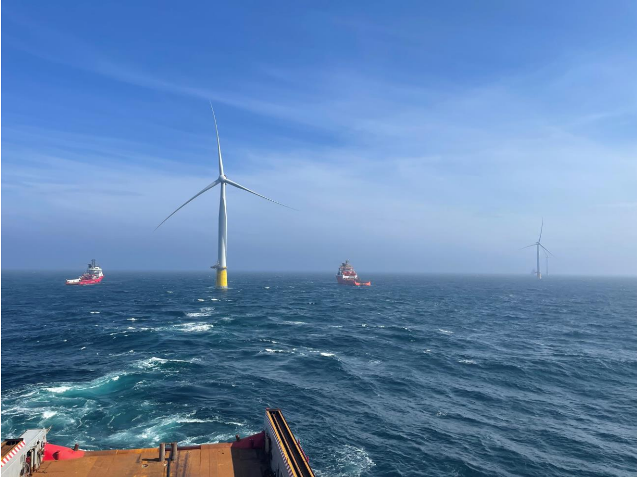
Towing of Equinors Hywind Wind turbine HY-09