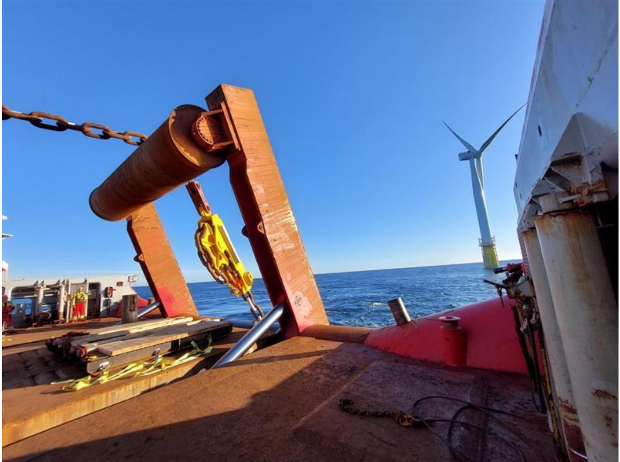
Inline tensioner overboarding at Hywind Tampen, Equinor.