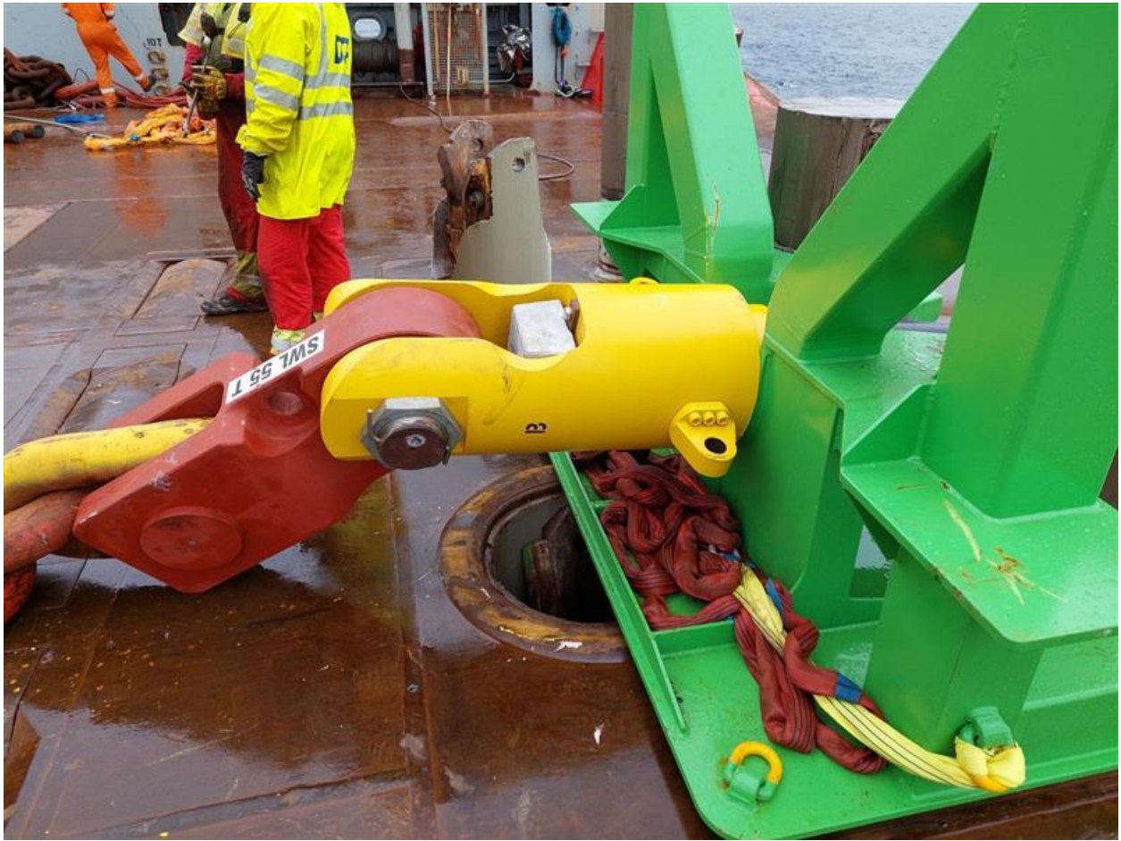
Socket securing frame designed by SEMAR