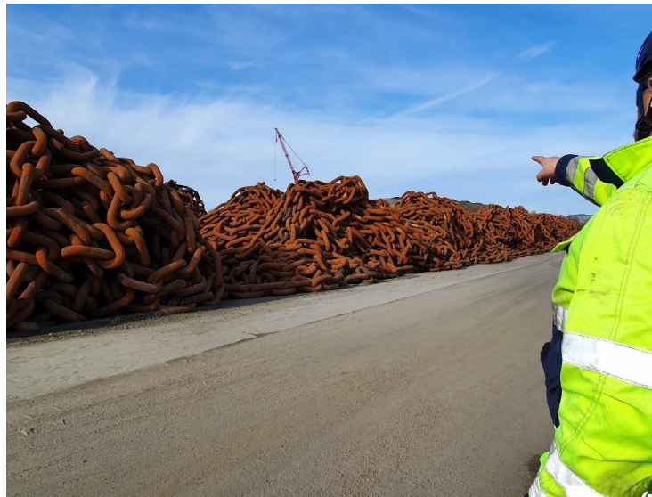
Equinor, Hywind Tampen – chains.